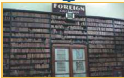
Xylarium- Collection of Authentic wood samples