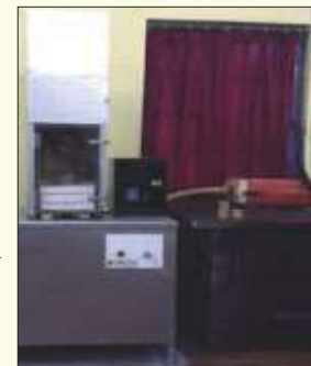
Wood Welding Machine

Wood welding is new to our country. In this technique wood joints can be made without using nails and adhesives making them more natural and chemical free. A wood welding machine has been designed and fabricated at Forest Research Institute, Dehradun. Success has been achieved in spin welding of wood pieces of few species.