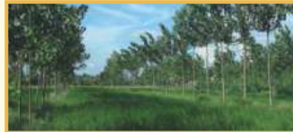
Poplar based agroforestry model with wheat