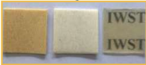
Natural wood (Left most), Lignin modified wood (middle) and Transparent wood (right most) placed on a paper with letters "IWST"