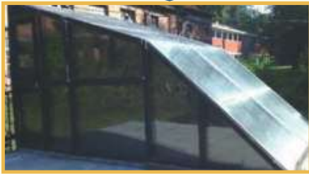
Head based storage Solar Kiln