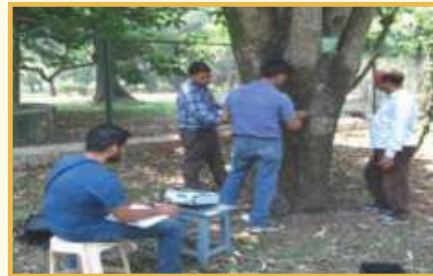
Measurement of hollowness in a tree using ultrasonic detector