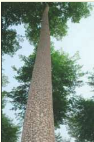
High performing and disease resistant clone of Melia sp.